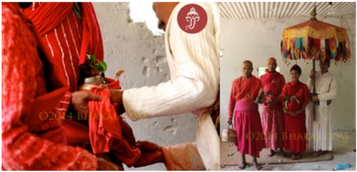
Rato Matsyendranath Captured At Chakra-tirtha