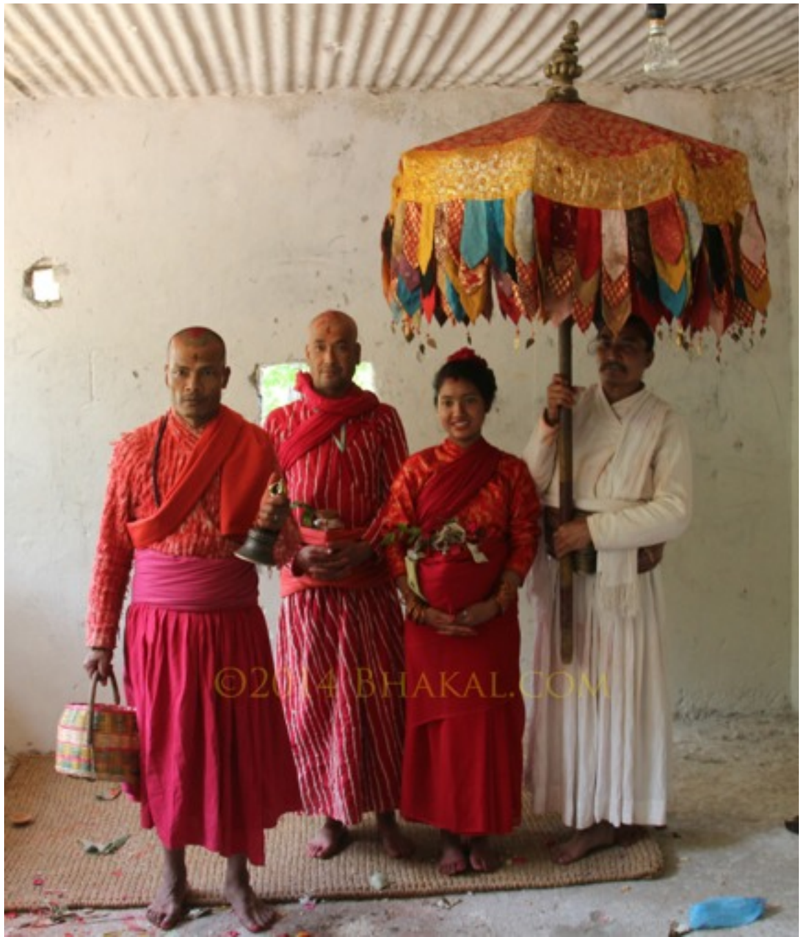
A Team Of Priests Bringing Matsyendranath From Chakra-tirtha