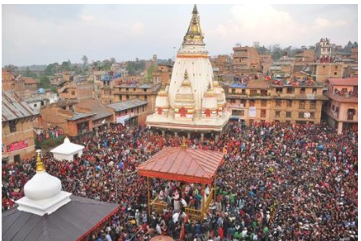
Winter Temple of Matsyendranath at Bungamati