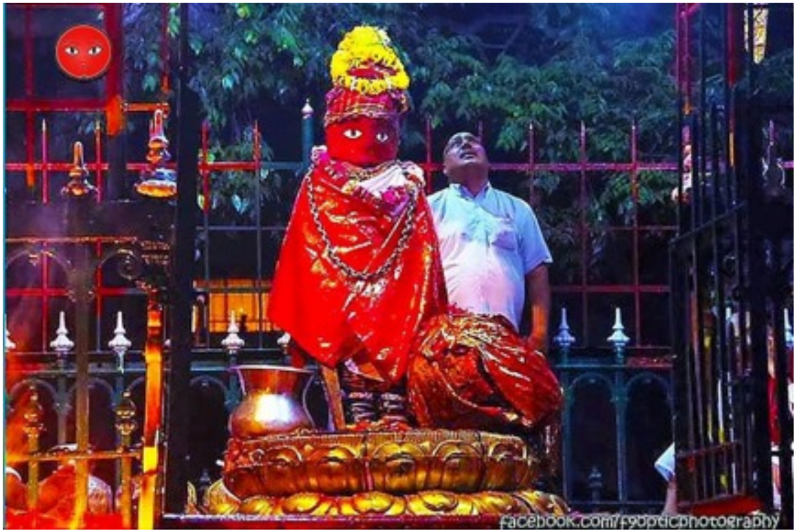
Matsyendranath waiting for Bathing Ceremony At Lagankhel