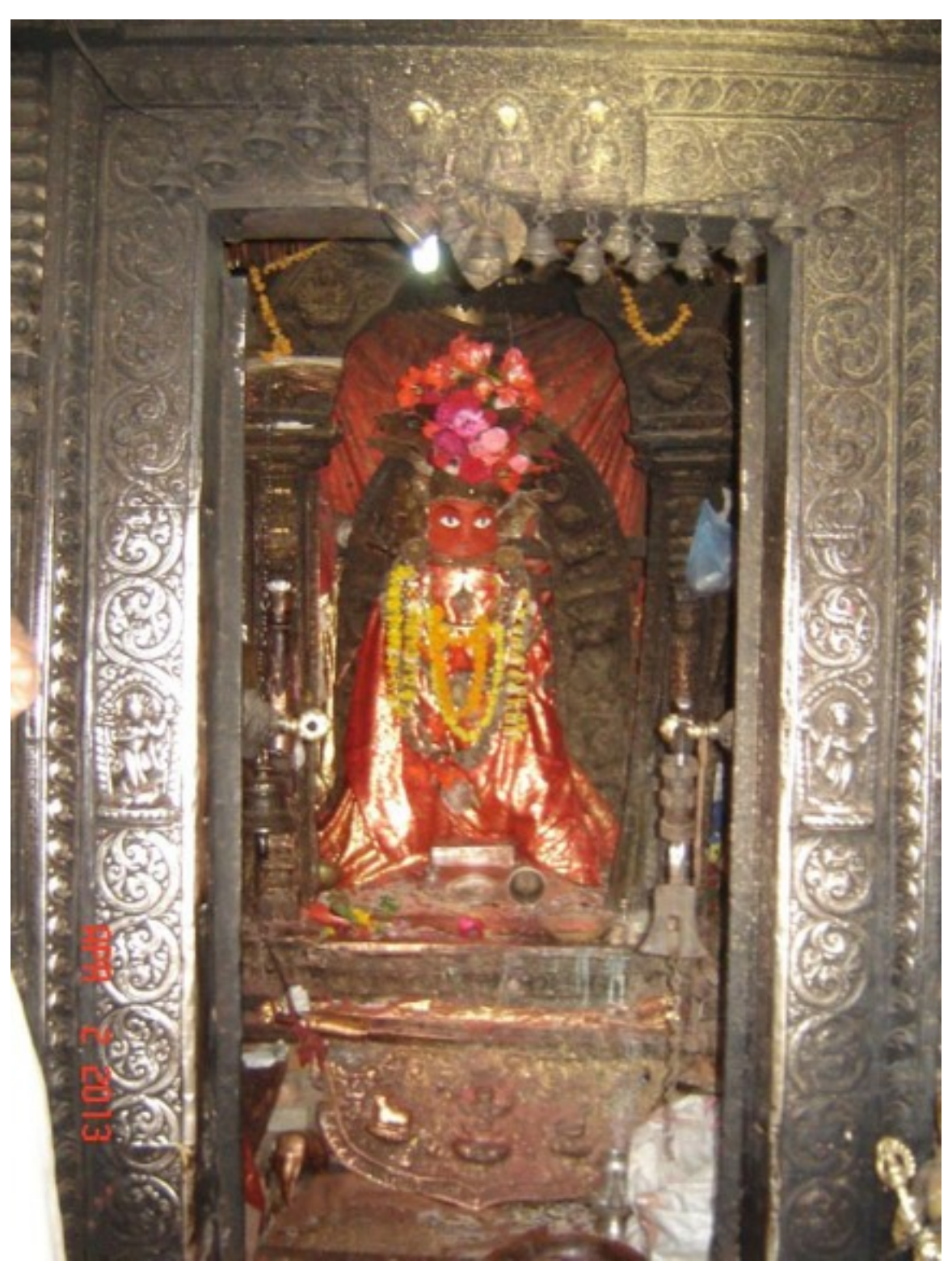
Lord Matsyendranath in the lord's summer temple in Patan